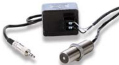
Remote Magnetic Sensor (MT-190-P) Gap 0.25 inches