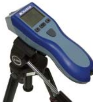
Pocket Tach 99 or Pocket Laser Tach 200 can be tripod mounted. Tripod not included.