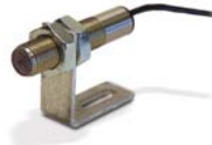
Remote Infrared Sensor (IRS-P) Gap 0.50 inches

Optional Remote Contact Assembly (RCA) with 6 foot cable.