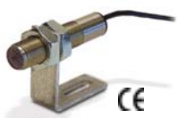
Remote Optical Sensor (ROS-P) Gap 36 inches

Optional plug-in Remote Sensors with 8 foot cables (100 feet optional)